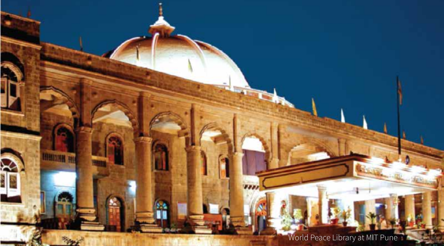
World Peace Library at MIT Pune